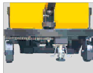
Chain Assist Steering System